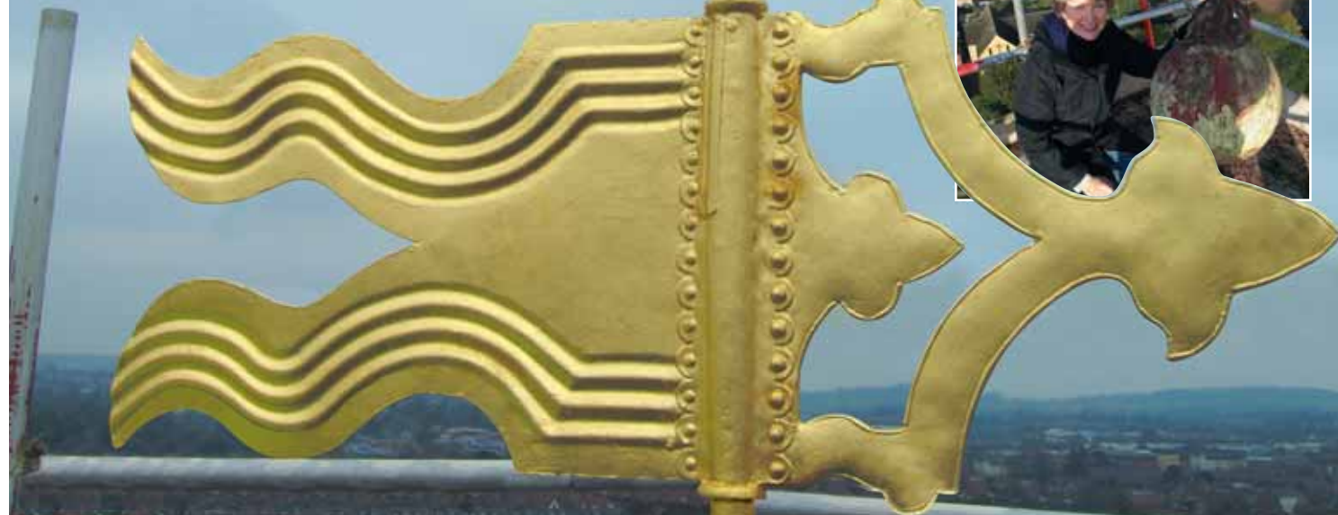
Bill Hicks, head of buildings team, writes:

Work has been going on throughout the year to repair the spire and tower. The main problem was vertical cracking of the stonework. This was repaired by drilling at an angle across the crack from both sides and at different levels, then bonding a stainless steel pin into the holes. Within the spire, stainless steel bands were bolted to the polygonal faces at several levels and linked to form strengthening bands round the structure. The keystones and sills of several of the lucarnes, or windows, in the spire were replaced and areas of worn stone cut out and renewed. Finally, almost the whole surface was re-pointed.